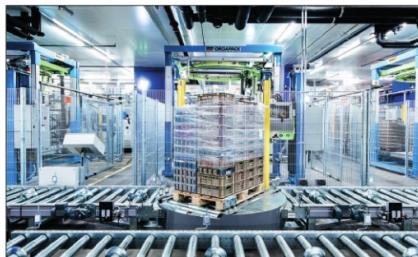
KNAPP's KiSoft Pack Master software calculates the optimal pallet profile so that loads are automatically palletized in a shop-friendly manner.

Fresh products usually arrive on site in standardized Migros crates or in foldable crates from an external pool. These units tend to be heavy, so manual picking would place a great deal of physical strain on employees. Automatic processing of the crates not only avoids this but also