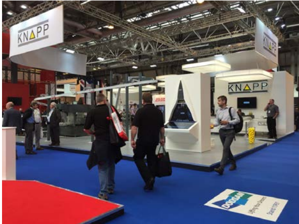
KNAPP welcomed a number of key clients onto its stand