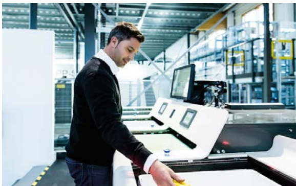
KNAPP’s Pick-it-Easy workstations feature pick-to-light technology and ergonomic design

The KNAPP stand featured the company’s Pick-it-Easy workstation, demonstrated in conjunction with its award-winning Pick-it-Easy Pocket overhead sorter. KNAPP also gave visitors live demos of its service application, WebEye, which uses a head-mounted camera to enable a technician to share system information via the Internet with a specialist in a remote location. In addition, visitors were able to see Vision Cube – KNAPP’s product dimensioning technology for pharmaceuticals and other small items – in action.