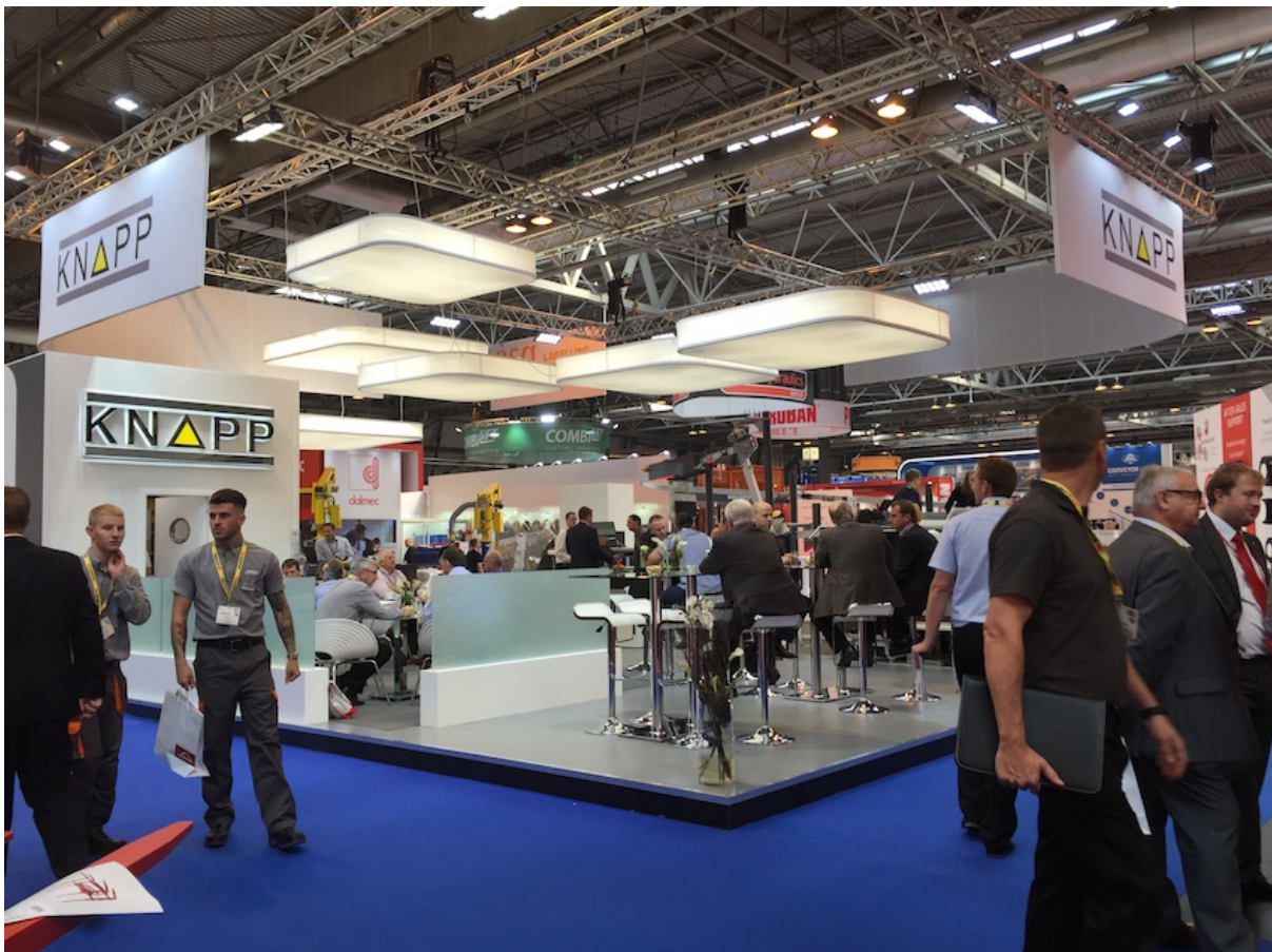
The KNAPP stand at IMHX 2016

Autumn is in the air and IMHX 2016 certainly proved fruitful for logistics automation provider, KNAPP.