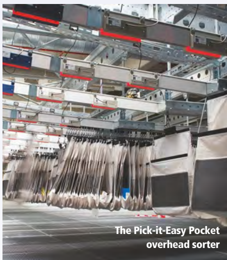
The Pick-it-Easy Pocket overhead sorter

The solution uses a three-step matrix sortation process to sequence the pockets into the precise order required by the packing stations. Pocket sorter technology was pioneered by Dürkopp Fördertechnik, a member of the KNAPP group, and over 1.75 million pockets have been sold by KNAPP to date.